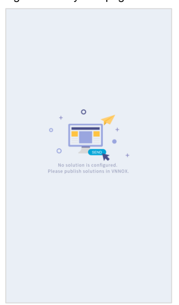
Figure 3-3 Playback page

After the player is bound successfully, the player can be found on the player list in VNNOX Standard.