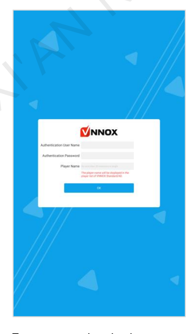
Step 2 Enter your authentication user name and password.