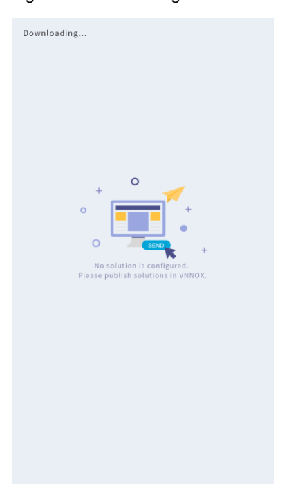
Figure 4-1 Downloading solution