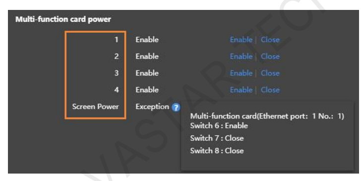
Figure 7-5 Multi-function card power

The labels in the orange box are defined in NovaLCT. One or more relay switches can be associated with a label. When multiple relay switches are associated and each of them is turned on (or off), Enable (or Close ) will be displayed, otherwise Exception is displayed and the detailed information of each switch is provided.