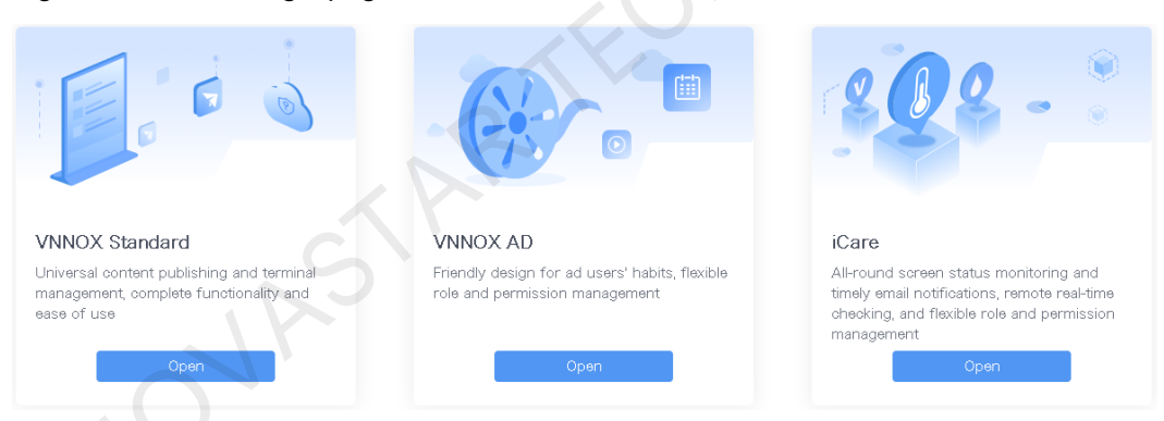
Figure 3-1 Service login page

Step 4 Click the Open button of VNNOX Standard.