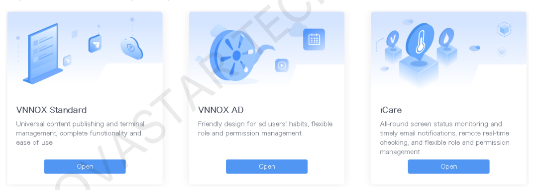
Figure 3-1 Service login page

Step 4 Click any position of the image of VNNOX Standard to enter its homepage.